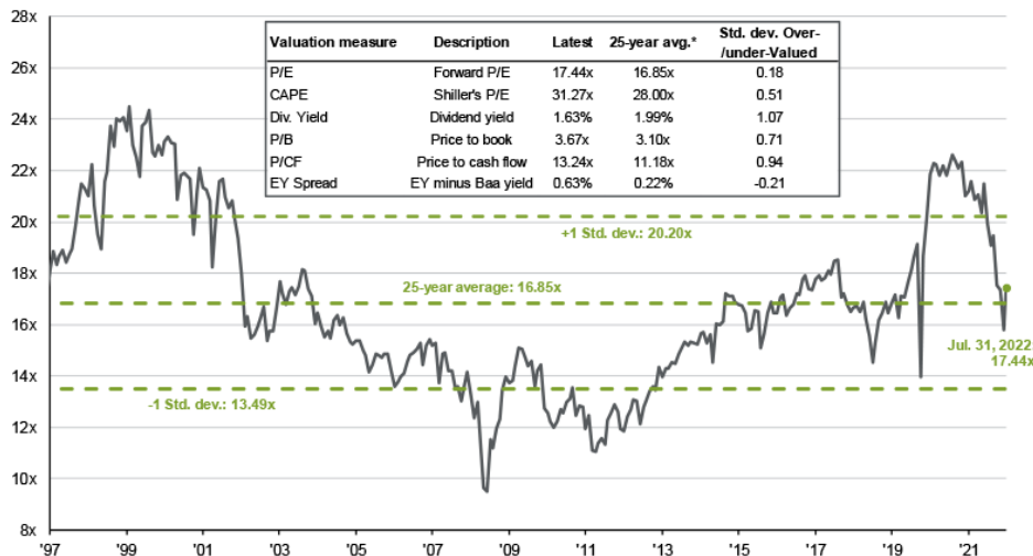
S&P 500 Index: Forward P/E ratio

We are also sharing an interesting piece of research provided by AMG Wilson Fisher. It is on the next page and shows the performance of the S&P 500 every year for the past 96 years. More than 70 years registered a gain for the stock market. A total of 36 years gained at least 20% while only 6 years showed losses of more than 20%. The chart provides good perspective for investors by showing that the stock market is overwhelmingly productive and profitable, with challenging years along the way.